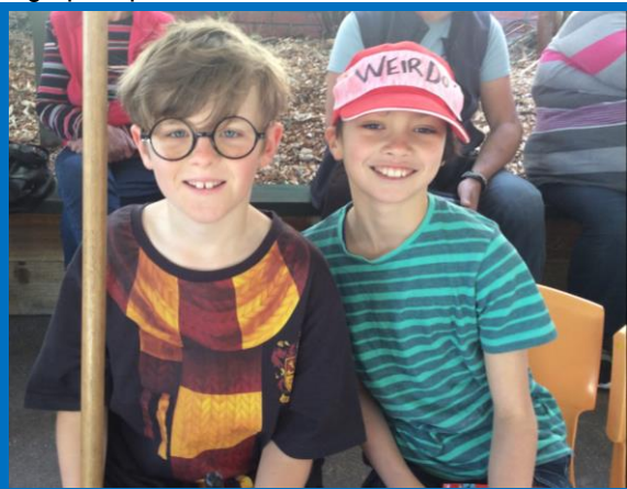
Harry Potter and Weir from the "Weir Do" series

K/1/2 continued the Book Week fun with an exciting treasure hunt. The theme for this year's Book Week was 'Find your Treasure', so students in K/1/2 worked together to read the pirate treasure map and search for gold in the sandpit. Luckily, Cobargo pirates are very generous, so everyone got to share the treasure!