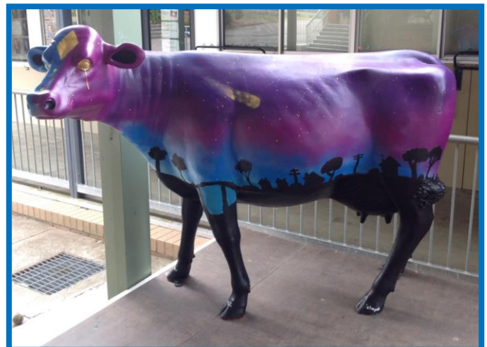
Luna's beautiful new paint scheme

The whole school then held a vote to decide which ideas we would like incorporated into the final artwork going onto the cow. They decided that a landscape painting of Cobargo's