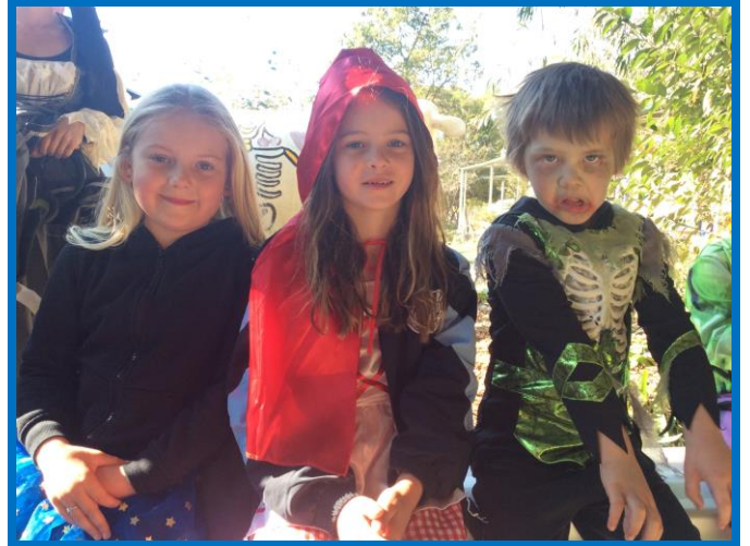
Wonder woman, Red Riding Hood and a zombie!

Thank you to all of the students and parents/carers for taking the time and making an effort to create the costumes, also to the wonderful Cobargo PS staff, for joining in by all dressing up as pirates.