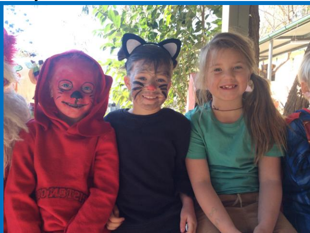
Clifford, Slinky Malinky and a creeper from Minecraft

Cobargo Cooperative Society Proudly sponsors this newsletter.